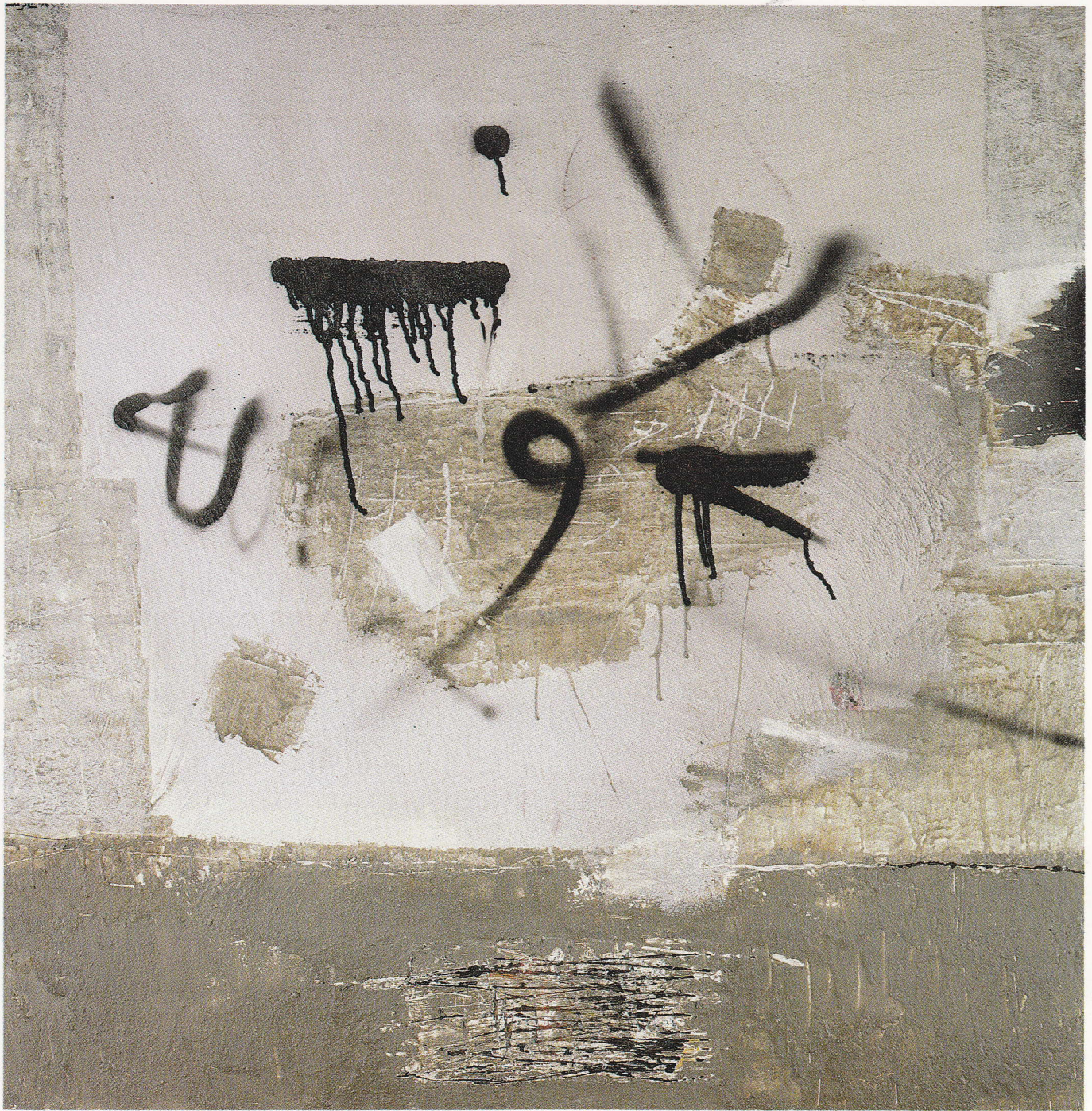
SHAKIR HASAN AL-SAID