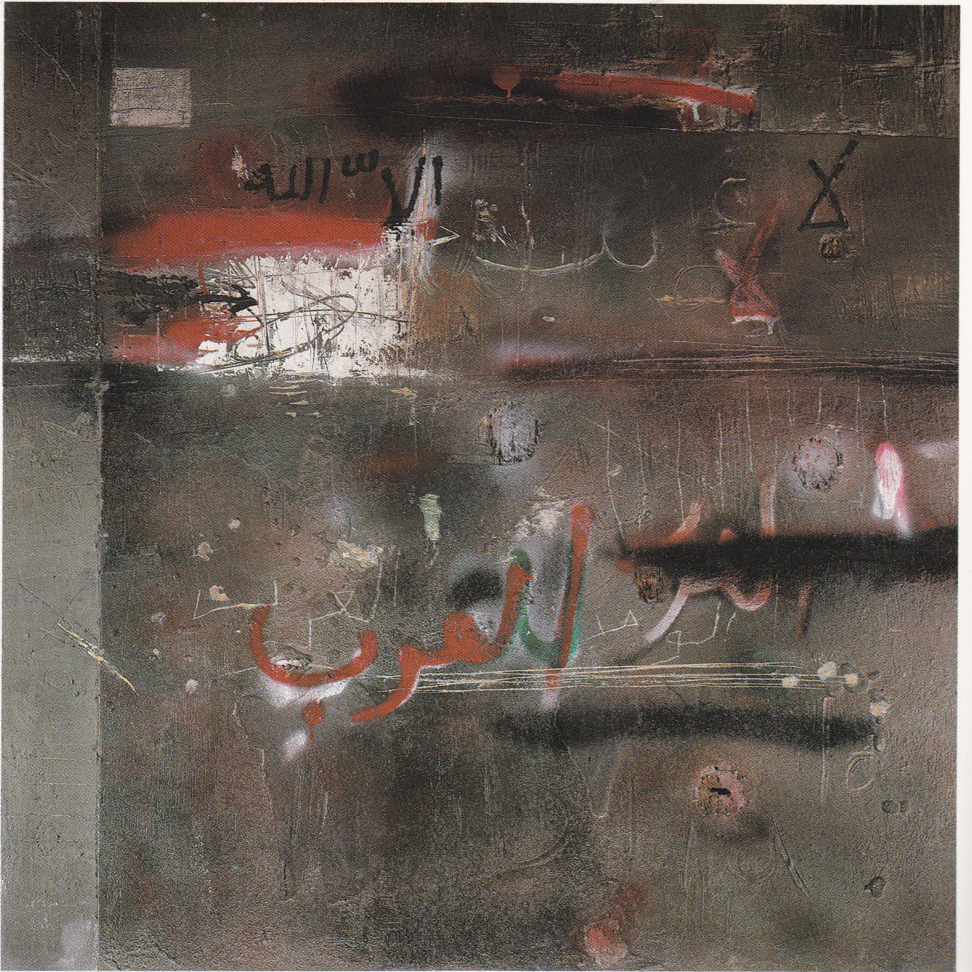
SHAKIR HASAN AL-SAID