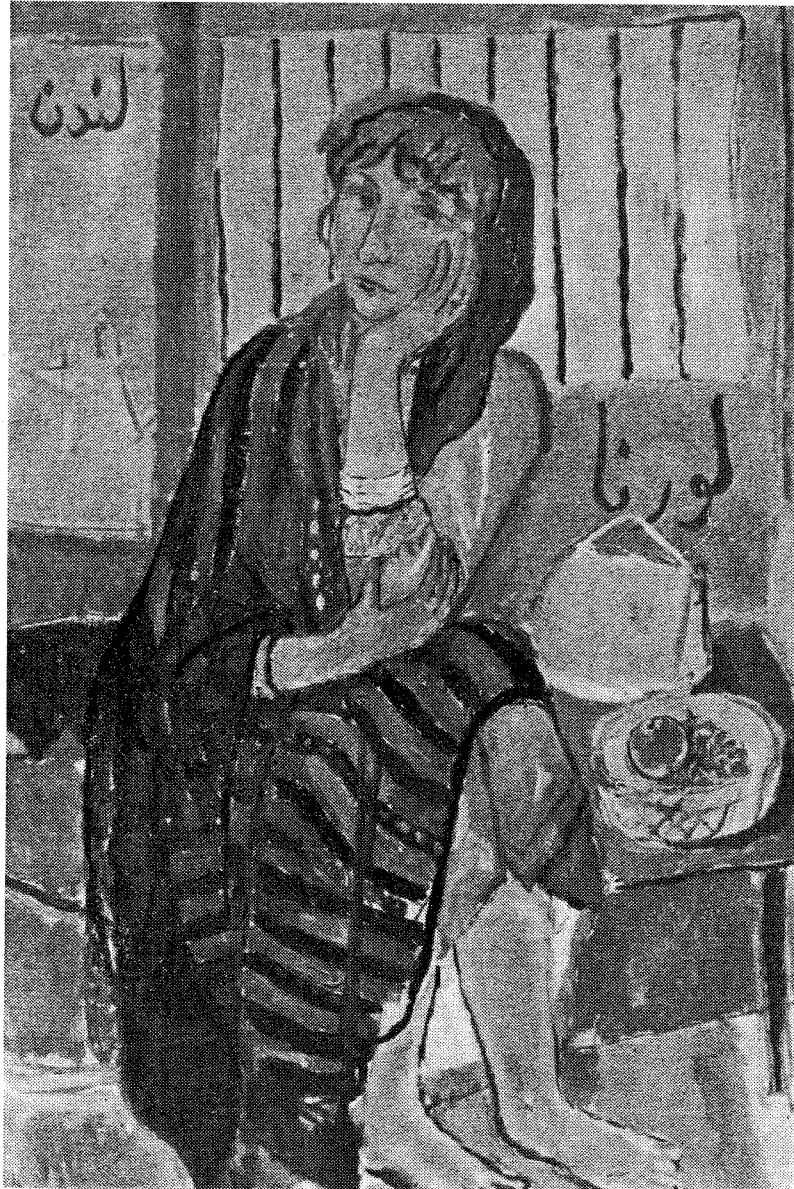
“Lorna”, Jewad Selim, 1948, oil, 23”×30”