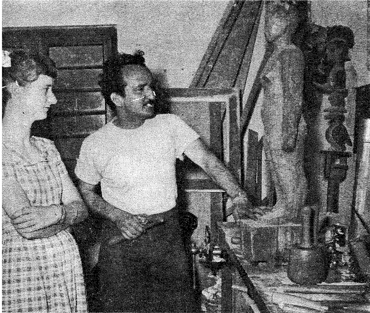
The Selims in their studio in Baghdad