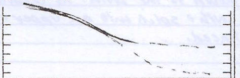
Section A, looking E