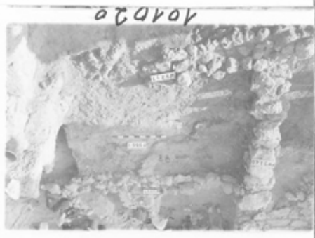
Section Files in photos unnumbered!